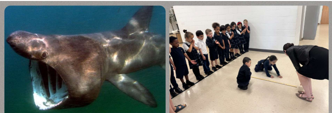
MEASURING THE LENGTH OF A BASKING SHARK (12M)