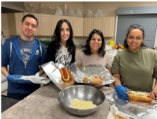
What a great hot lunch team!