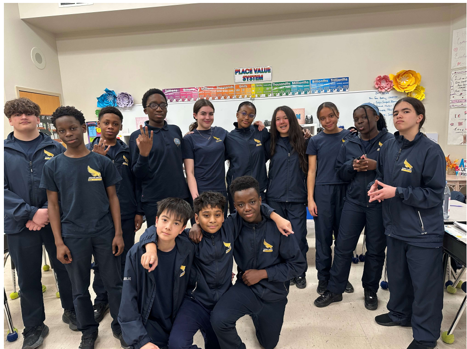
What an awesome group!