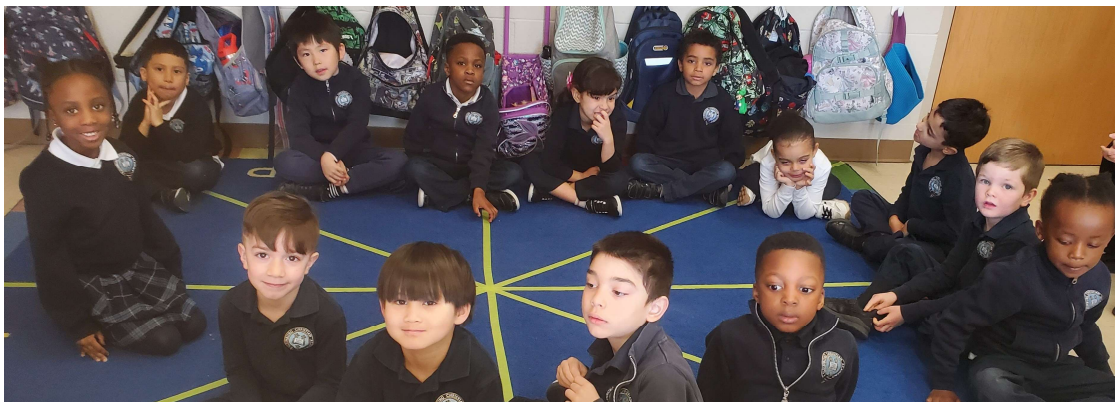
Learning about diagonals and triangles

Special Activity: Rock & Rings (curling) on Monday